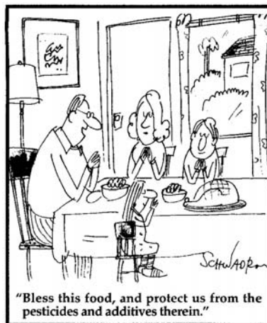
from JoyfulNoiseletter.com