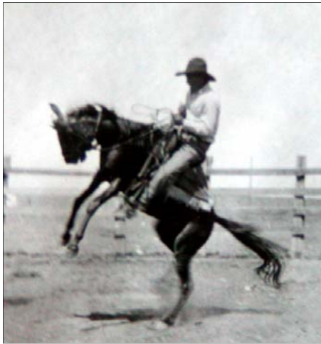
The ride of faith is not always a smooth ride, but the author of life rides along with us.