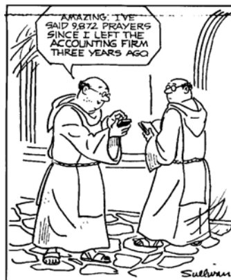
from The Joyful Noiseletter