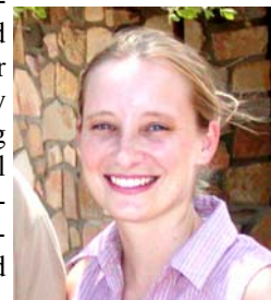
Photo Language and Mutual Invitation at Casa de la Rosa